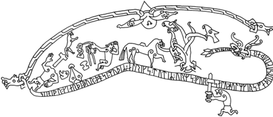
Figure Error! No text of specified style in document..1. The Ramsund Runestone, Sweden. This large carving on the flat side of a sloping rock outcrop portrays the tale of Sigurðr Fafnisbani, the slayer or bane ( bani ) of the dragon Fafnir.

Sample Second Semester Course in Old Norse. Please feel free to change or alter as you see fit. This course, as it is arranged, is the second of a two semester course series. If one wishes to have just a single semester, please alter to include more lessons. See also the sample Old Norse course syllabi in quarters.